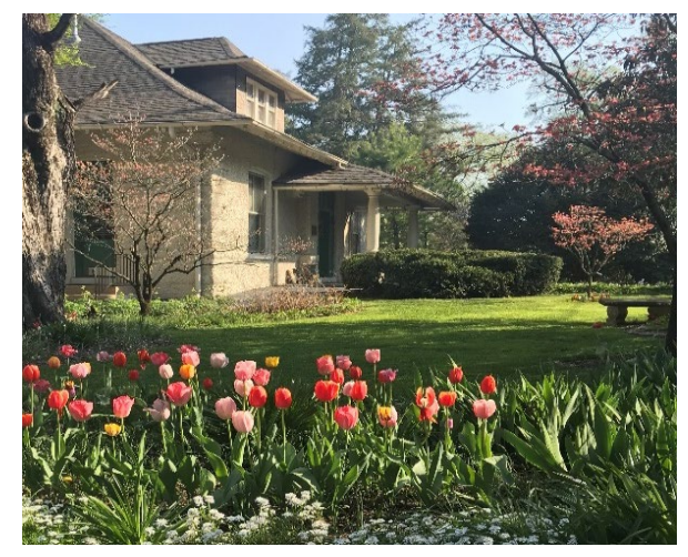
Located at 1943 Tennessee Ave., Knoxville, TN 37921

State Headquarters of the Tennessee Federation of Garden Clubs